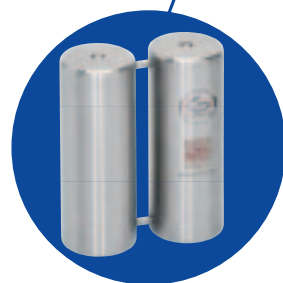
GRANDER® Energy Rods